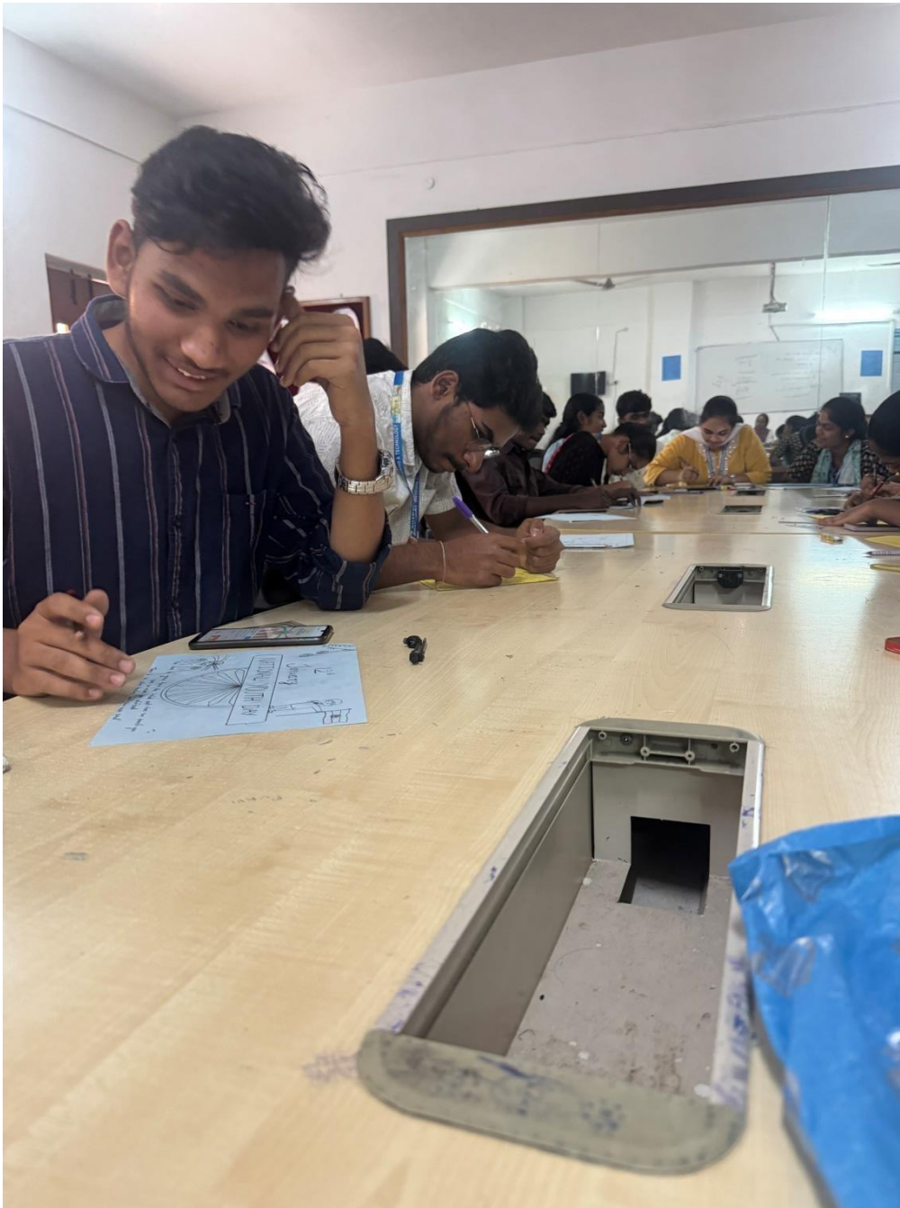
ACTIVE PARTICIPATION BY THE STUDENTS