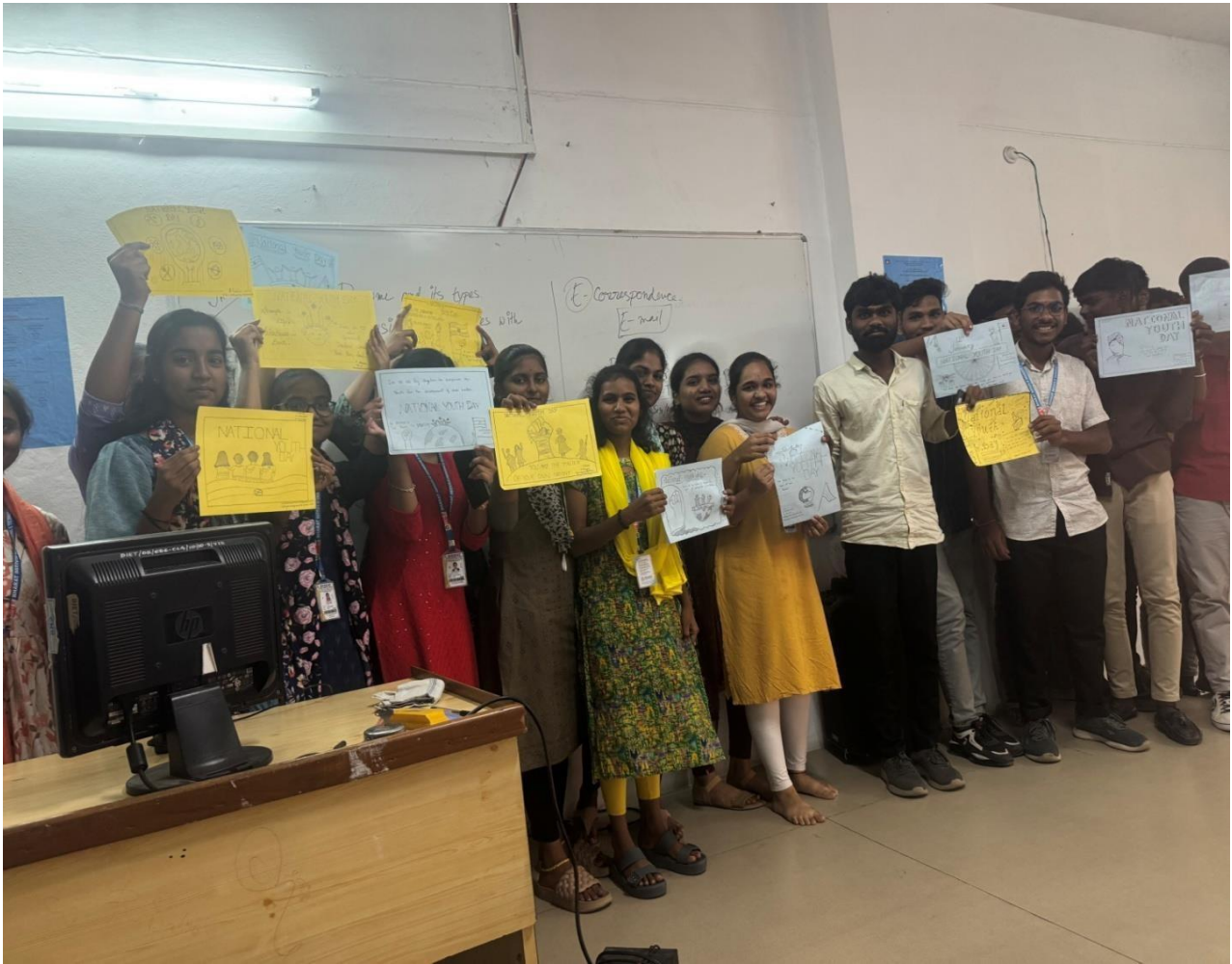
STUDENTS SHARING THEIR VIEWS